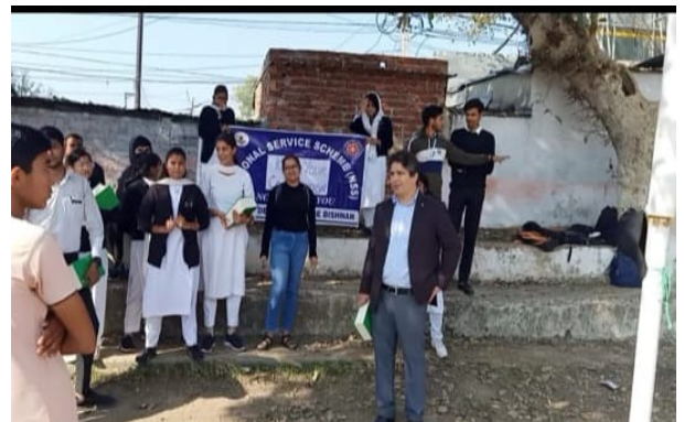
GDC Bishnah celebrated constitution day on 26.11.2023