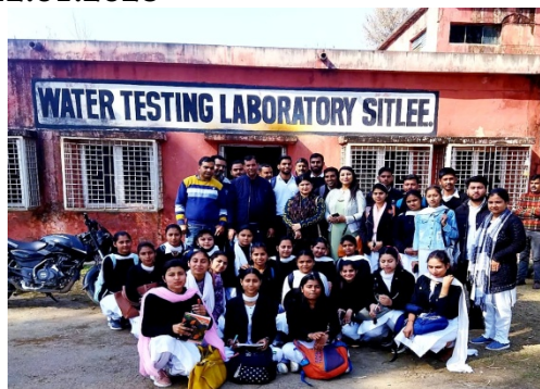
A visit to water treatment plant in Nagrota on 07.02.2023