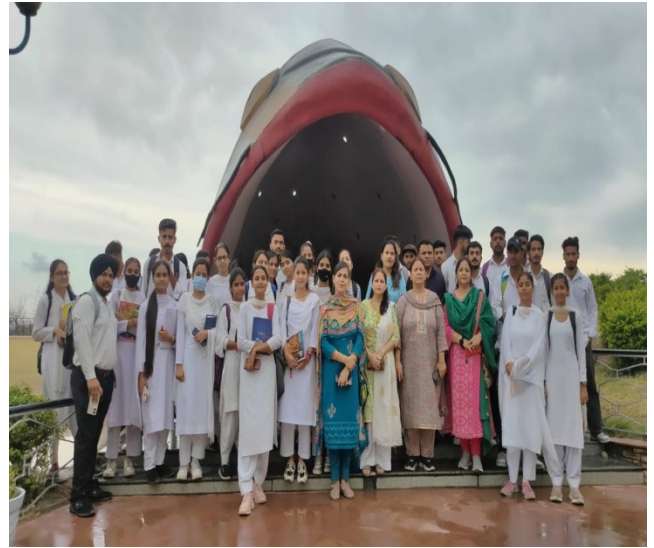
GDC Bishnah organised field visit to Bagh-e- Bahu Fish