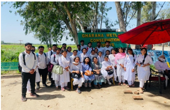
A visit to Gharan Wetland on 06.04.2023