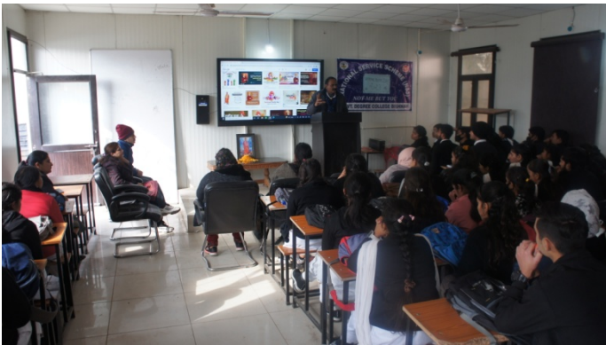
Celebration of National youth day on 12.01.2023