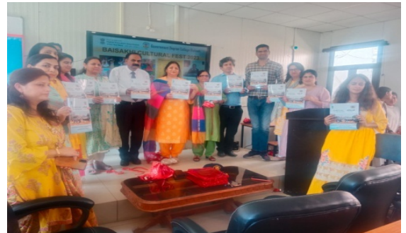
Magazine inauguration on 13.04.2023