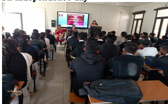
Guest lecture organised on solid waste management